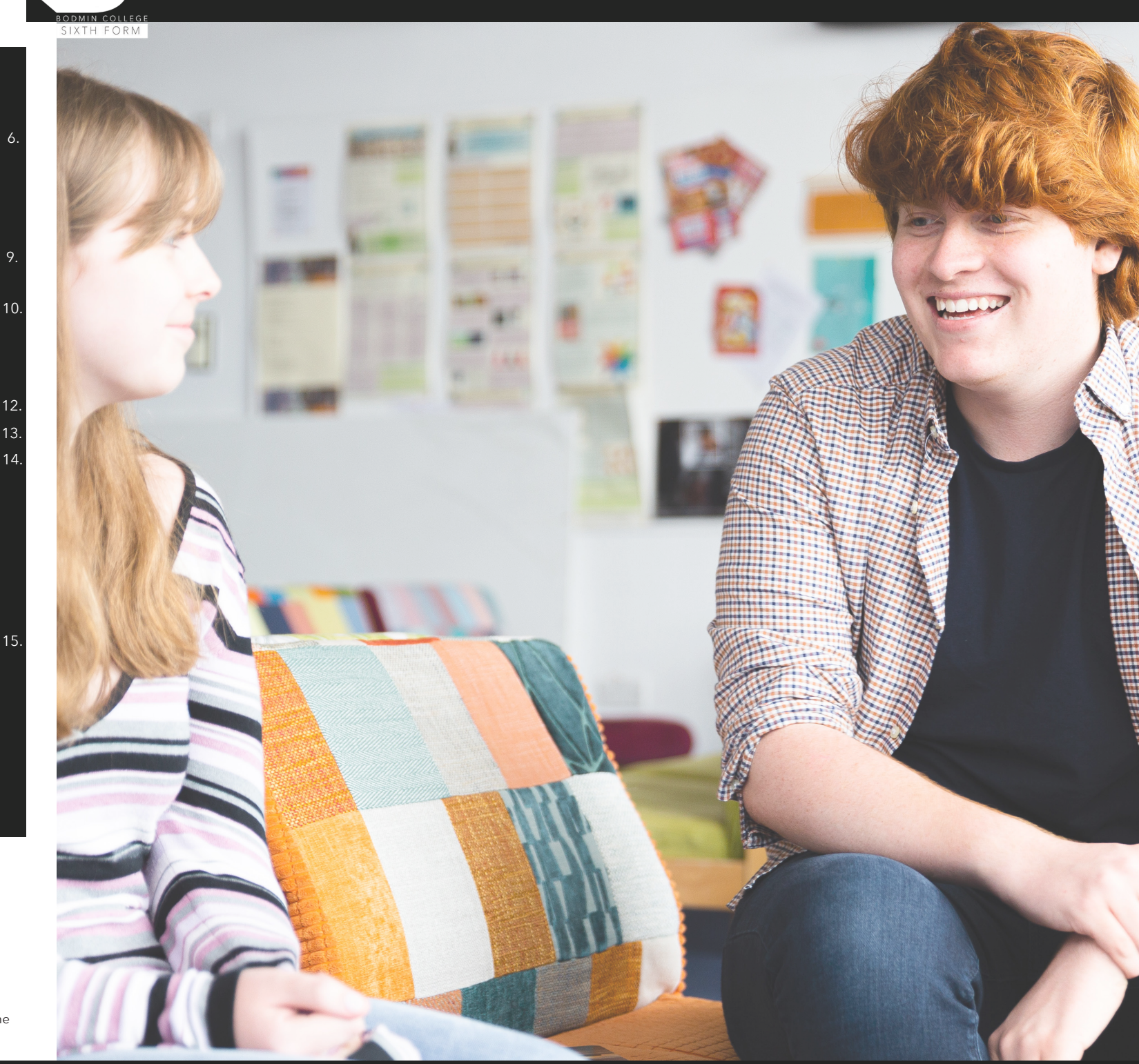
Design by Idenna. Printing by St Austell Printing. Information published in this prospectus is accurate at the time of going to press, and may change without prior notice.